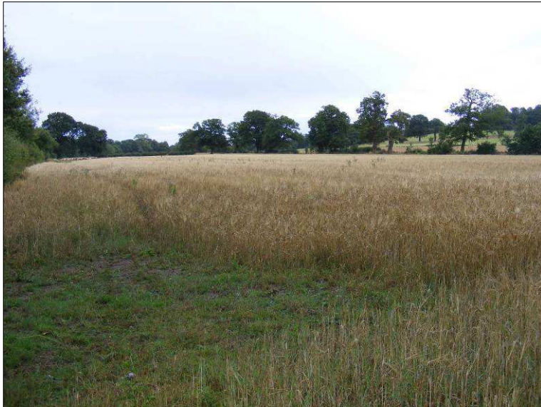
Plate 5: View of possible rise (centre of picture) in eastern field looking east