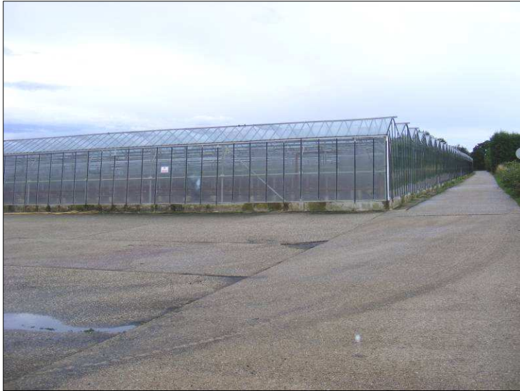
Plate 1: View of the greenhouses at the nurseries, looking east