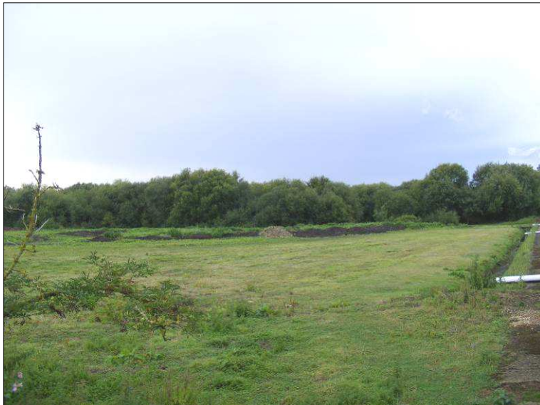
Plate 2: View of the rough ground and reservoirs behind the nurseries, looking north