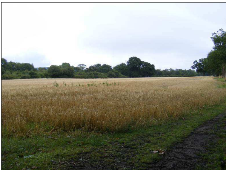
Plate 3: View of the site east of Alfold Road, looking northeast