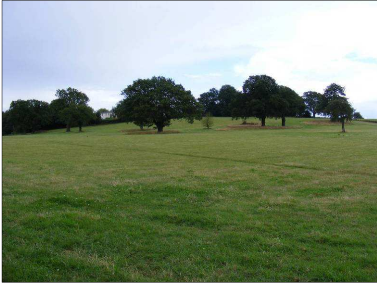
Plate 4: View from the site towards Knowle Park estate looking southeast